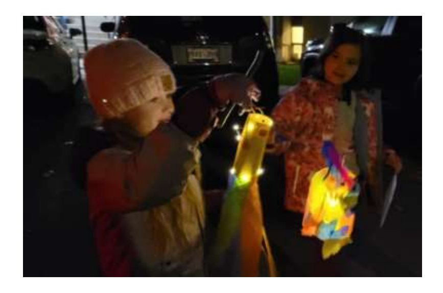
And we had the German St Martin Lantern walk with lots of kids and colourful lanterns!