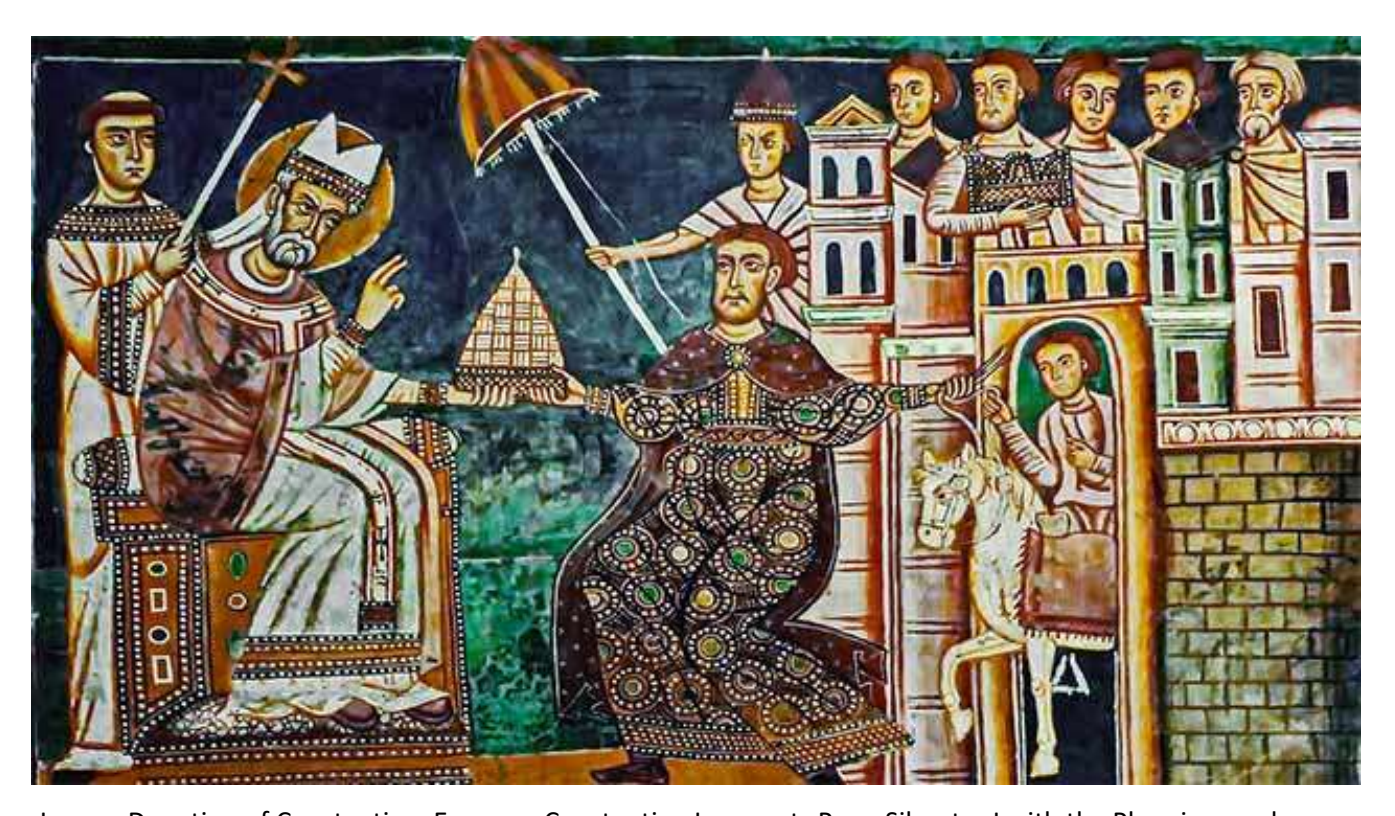
Image: Donation of Constantine. Emperor Constantine I presents Pope Silvester I with the Phrygium and the city of Rome.

Rest in peace Silvester, confessor, miracle worker and Bishop of Rome.