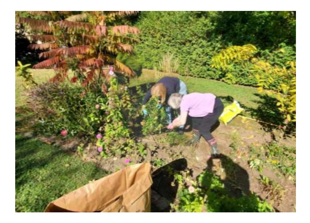
We worked in our church garden!