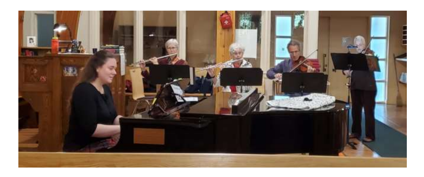
We celebrated lovely Services full of wonderful music!