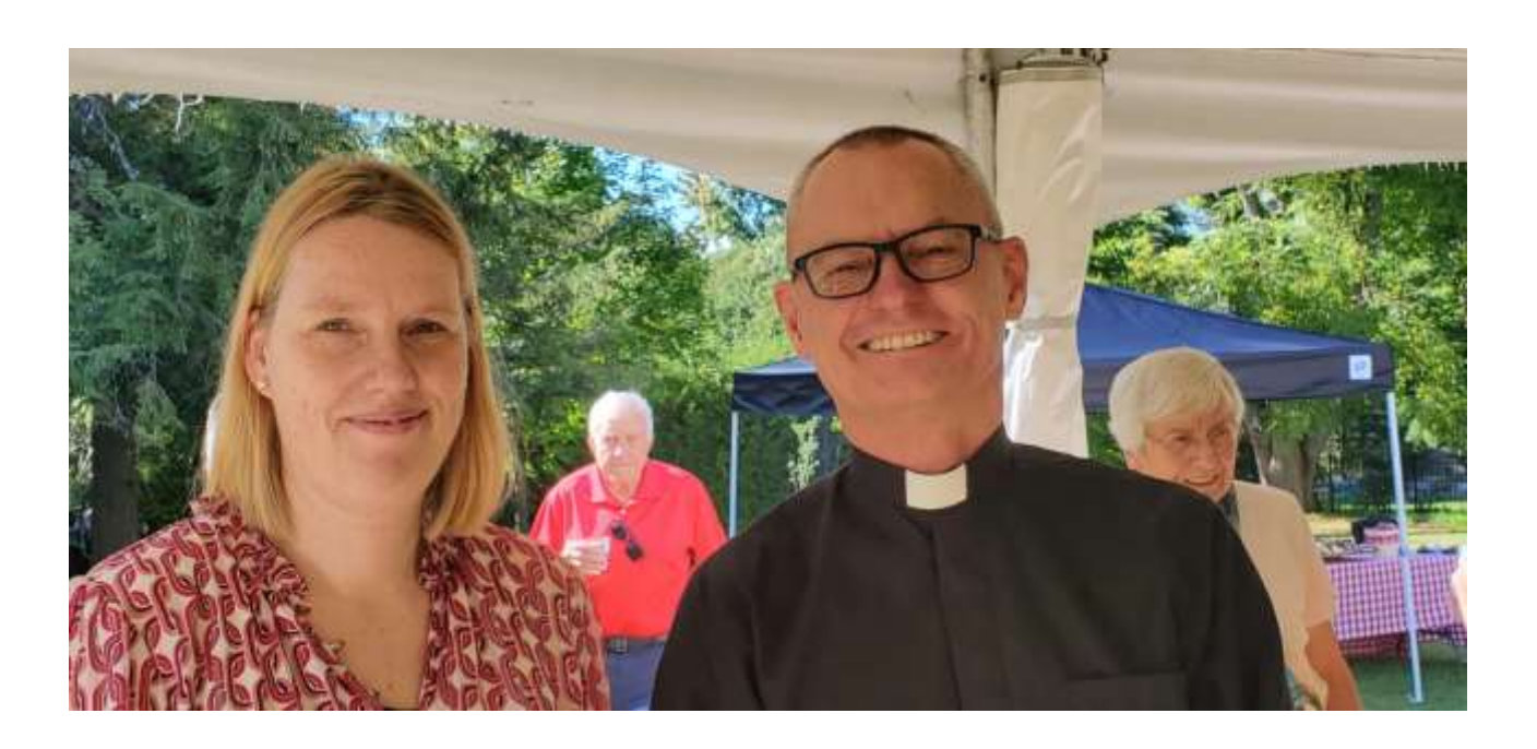
Together with the Catholic St. Albertus church, we celebrated the German Erntedankfest in the garden of the German Embassy!