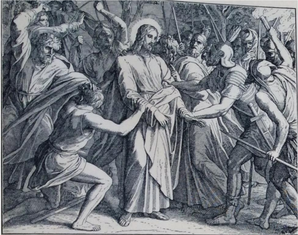
169. Gefangennehmung Jesu. Matthäus 26, 47— 56.