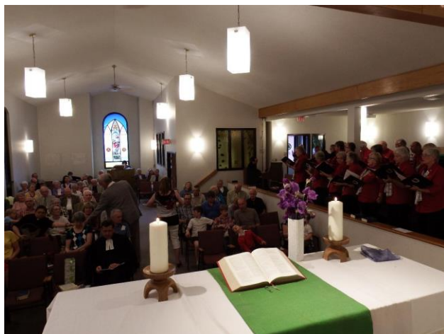
Farewell Service June 3 at Preston Street with Concordia Choir