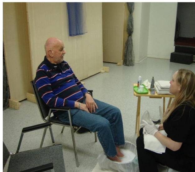
The April Foot Care Clinic