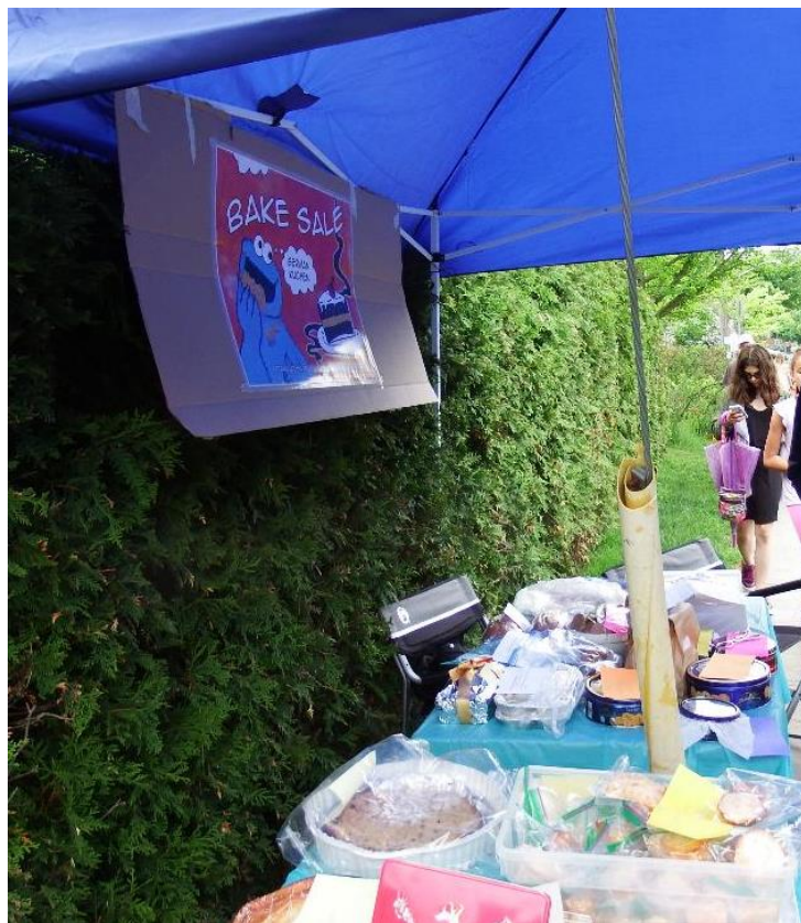
The fundraiser for the Ottawa Lutheran Refugee Sponsorship Committee, May 26, Great Glebe Garage Sale All together $ 1500. About $ 400 through our bake sale (all the cookies, muffins and cakes came from members of our congregation, big thank you!!)