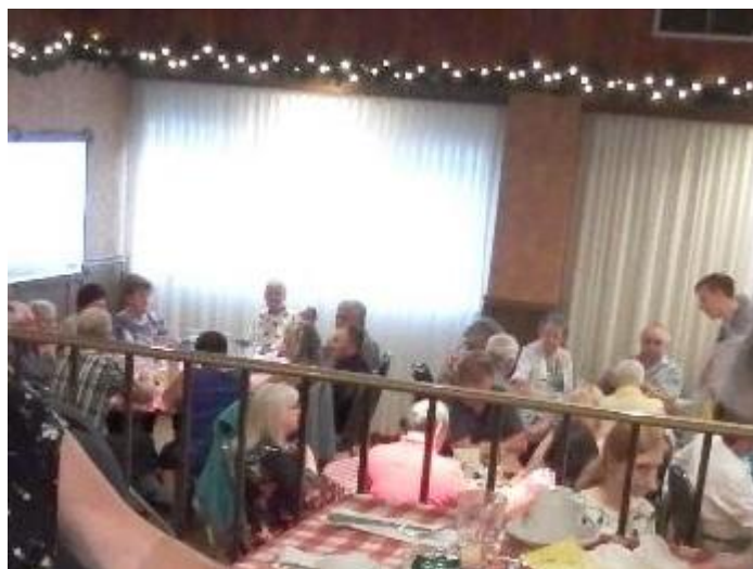
Spring Festival Dinner Dance June 2, 2018