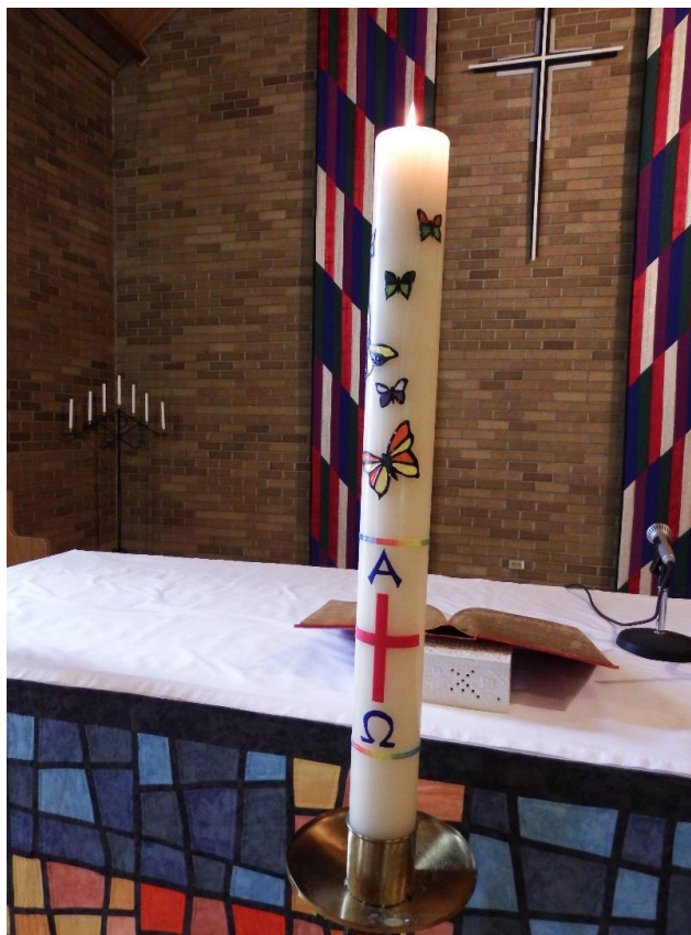
Easter Sunday:Easter light with butterflies