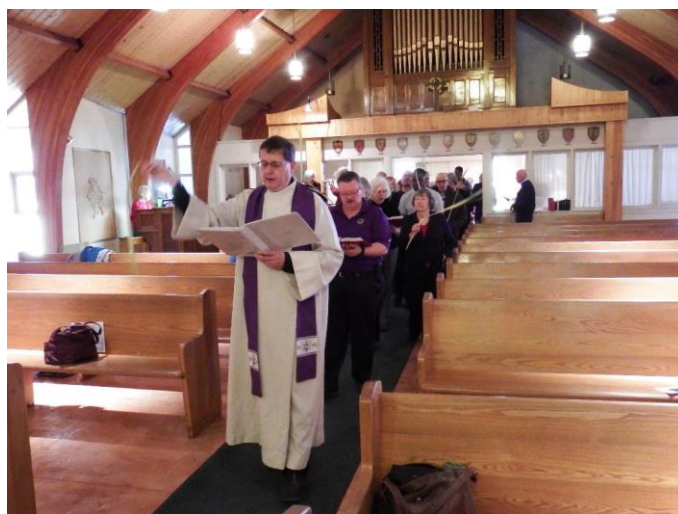
Palm Sunday, The Procession of the Palms