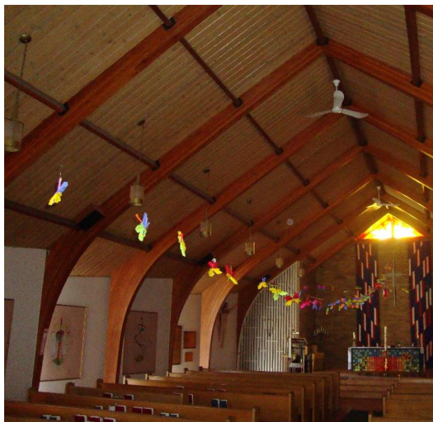
Easter Sunday:Easter Butterfly Chain